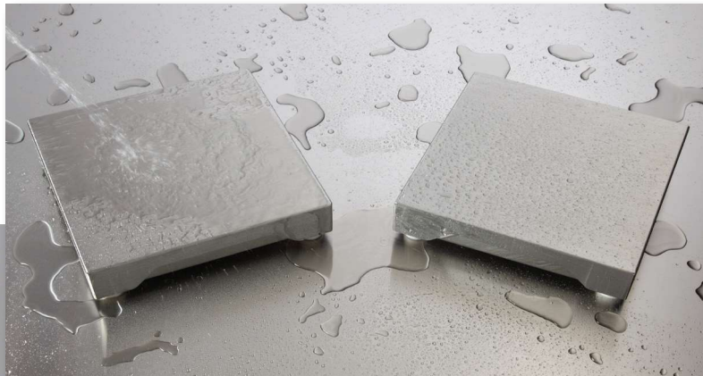
Engineered to meet NAMI's 10 Principles of Sanitary Design.