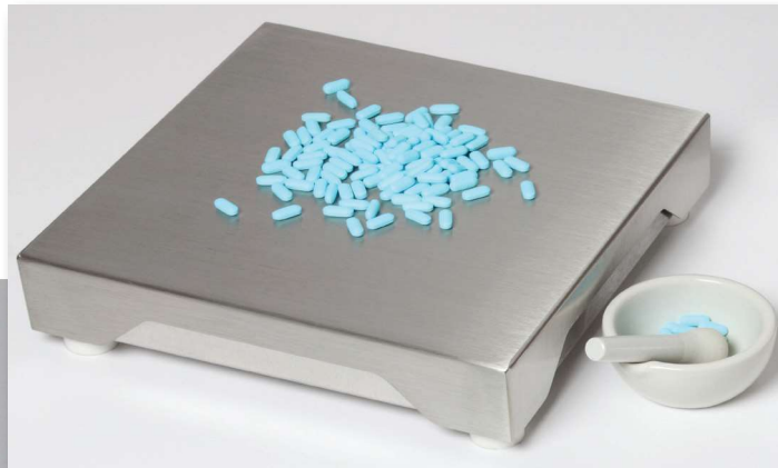
Exceeds sanitation needs of most pharmaceutical/chem applications.