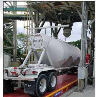
Predictive Cutoff simplifies filling operations.