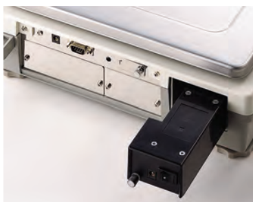
Rechargeable Battery Rechargeable Battery Option for portable operation.

All FC-i and FC-Si models utilize ACAI, A&D's exclusive Automatic Count Accuracy Improvement. ACAI combines the two most critical performance requirements of a counting scale: count accuracy and operation efficiency. Initial Average Piece Weight can be determined through an operator's choice of fixed, random, keyboard entry, or memory recall.