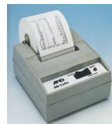
AD-1191 Dot Matrix Compact Printer