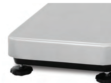
Remote Scale Remote Scale Option using A&D SB Platforms or most other manufacturers' load cell platforms.