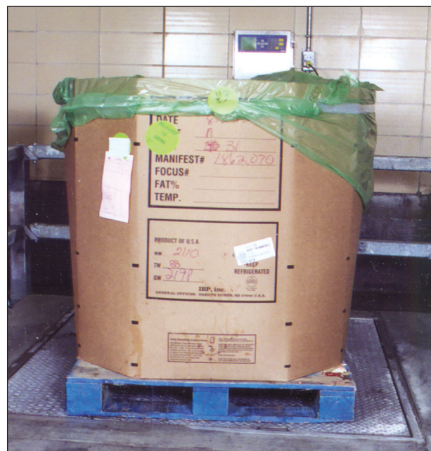
The Aegis Lift Deck is designed to handle high volumes and heavy loads in sanitary, washdown environments.

Capacity . . . . . 1,000 to 5,000 lbs Excitation voltage . . . . . to 15 VDC Construction . . . . . 17-4 PH stainless steel Sealing . . . . . IP69K Approval . . . . . Factory Mutual, NTEP