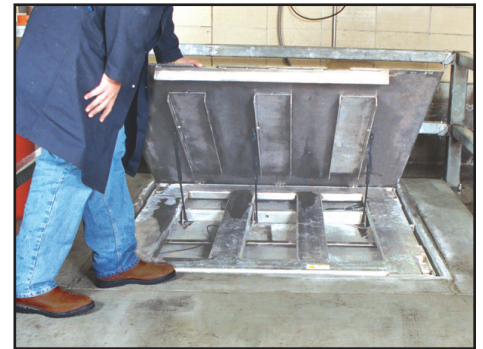
Although one of the heaviest structural steel floor scales in its class, the Lift Deck platform is easily raised and lowered by a single operator for routine cleaning.