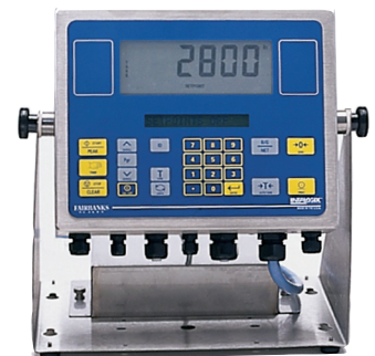
Intrinsicly Safe 2800

Fairbanks' powerful, yet economical FB2255 Series Analog Instrument is a feature packed floor scale controller that offers all the communications options and data collection features required in most meat processing or RTE sanitary applications. It is NTEP, MC and ETL approved.