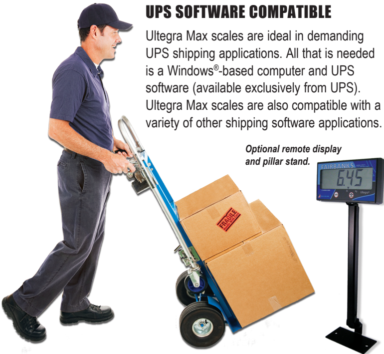
Optional remote display and pillar stand.

Ultegra Max scales are ideal in demanding UPS shipping applications. All that is needed is a Windows ® -based computer and UPS software (available exclusively from UPS). Ultegra Max scales are also compatible with a variety of other shipping software applications.