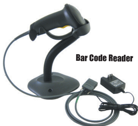
Bar Code Reader