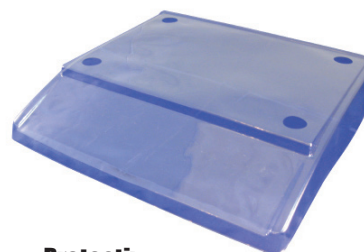
Protective Scale Cover