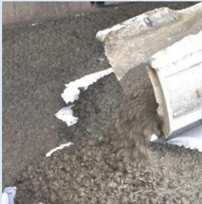
Engineered concrete mix, factory poured and cured

A properly poured, finished and cured concrete deck truck scale will provide you years of trouble free service. The key word though is properly. Some buyers will prefer a steel deck because there is less risk as compared to a field poured scale. Again, a compromise is made. The benefits of concrete are sacrificed to prevent concrete quality issues from becoming a problem later, for the owner. With TensileCore engineered concrete, this is no longer a compromise you have to make. When you select TensileCore, you are selecting a properly built concrete deck. The mix is engineered with steel fibers and silica fume to add reinforcement and density – something field pour concrete commonly doesn't offer. The pour and finish is supervised and done under ACI (American Concrete Institute) guidelines – something that may or may not happen in the field. The slump, temperature and air entrainment are all controlled and documented at the factory based on ACI guidelines – something that may or may not happen in the field. All of this factory control leads to a properly finished concrete deck. Using these technologies and methods eliminates any potential for sub-standard quality concrete. TensileCore engineered concrete is properly made and offers you an option to steel and confidence that it is done right.